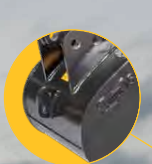
Lift lug on all pin-on buckets for easy, secure lifting

Choose a Wain-Roy® quick change or Gannon® pin-on bucket. All buckets fit a wide range of machines. Our latest line of compact excavator buckets was designed, after input from customers like you, to ensure they're easy to use and service, long-lasting, and high performing.