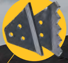
Optional replaceable, bolt-on side cutters: Straight or Saw Tooth

Ideal for contractors, rental fleets, as well as farmers, and municipalities